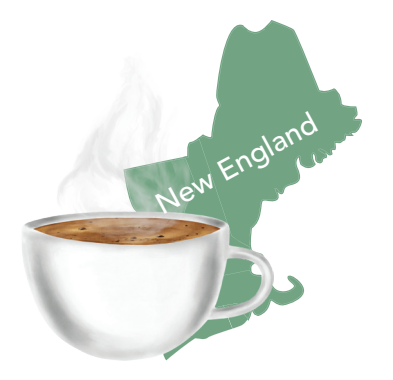
Produced in the USA

We believe that naturally simple allergen friendly foods and ingredients are essential to your health and well-being. For our hot cocoa we sourced the highest quality organic and kosher ingredients, without any preservatives, from sustainable and socially conscious partners, to create a delicious treat made from simple ingredients. We create our cocoa in a woman-owned and gluten free facility in New England.