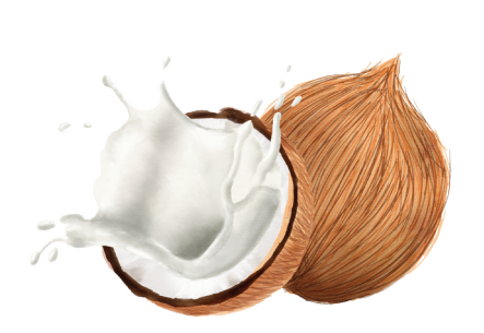
Allergen Friendly Ingredients