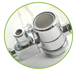
Dual-Hose Diverter Valve for use with Countertop Kit