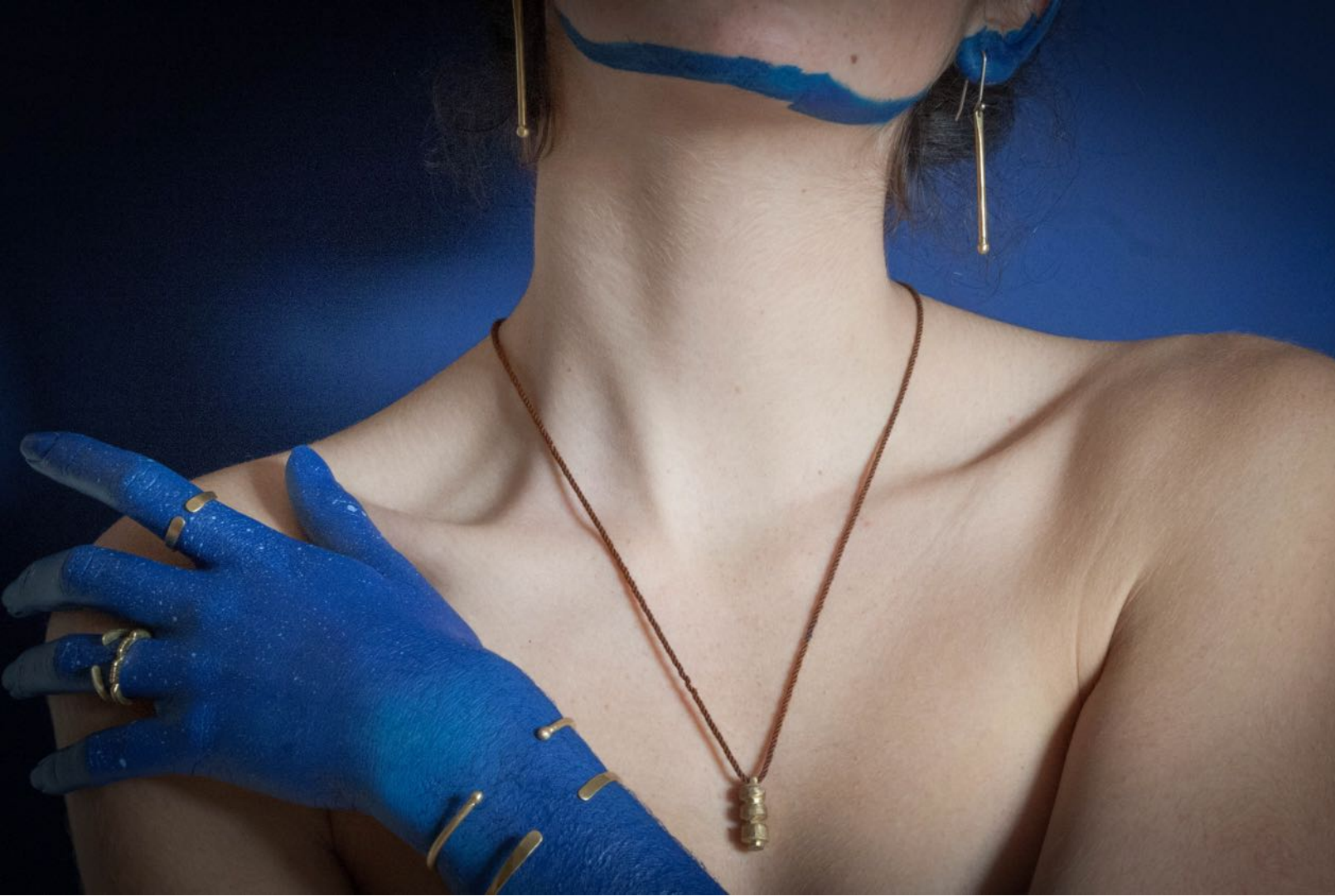
Above: Alike Earrings, Maia Necklace, Alike Cuff, Hera Cuff, Hera Ring, Calla Ring, Niilo Ring