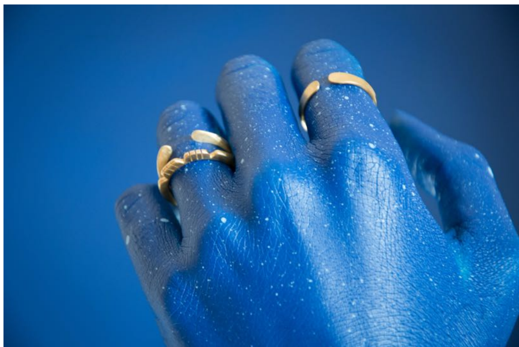
Above: Kaia earrings, Niilo Necklace, Hera Ring, Iris Ring Below: Calla, Ring, Niilo Ring, Hera Ring