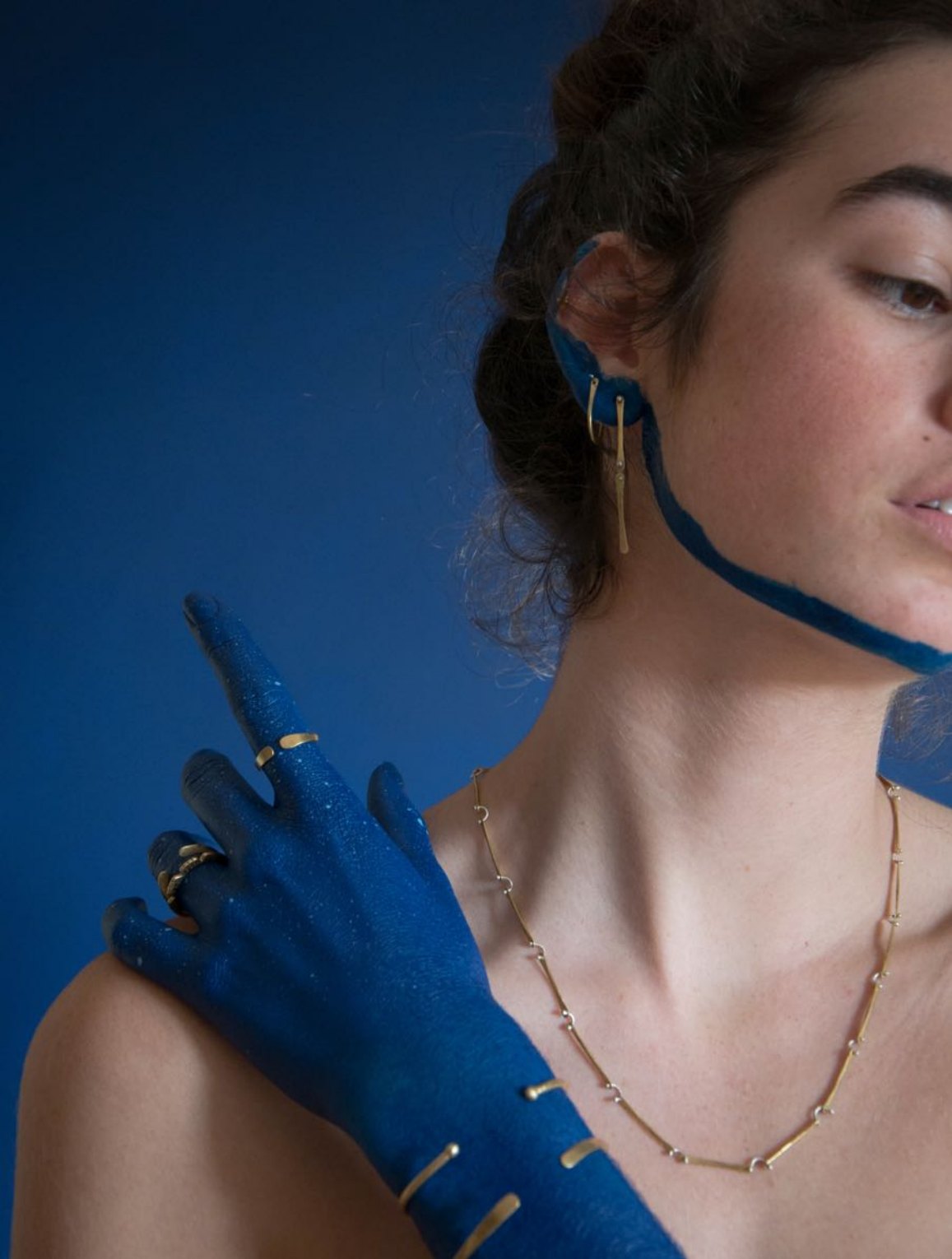
Above: Nyssa Earrings, Ares Earrings, Nyssa Necklace, Hera Ring, Calla Ring, Niilo Ring, Alika Cuff, Hera Cuff