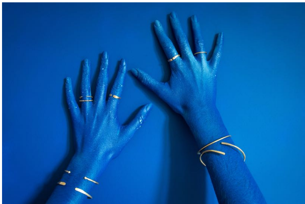
Above: Kaia earrings, Niilo Necklace, Hera Ring, Iris Ring Below: Calla Ring, Niilo Ring, Hera Ring, Iris Ring, Alika Cuff, Hera Cuff, Iris Cuff, Helios Bangle