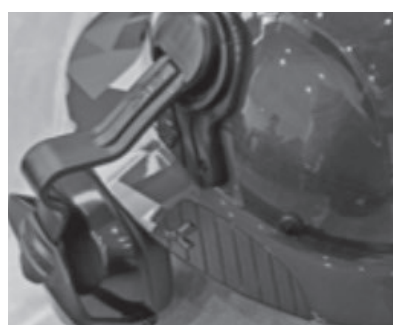
ATTATCH LEFT AND RIGHT EARMUFFS TO THEIR RESPECTIVE BRACKETS