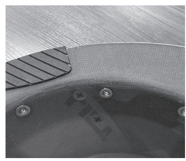
ENSURE SCREWS ARE FIRMLY ATTACHED