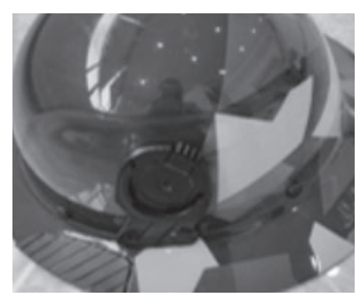
SCREW THE MOUNTS ON AND TIGHTEN