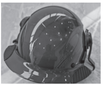
REMOVE PREVIOUS BRACKETS, MOUNT LEFT AND RIGHT DAX BRACKETS