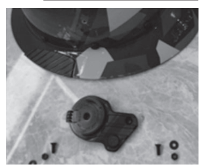
MARK AND DRILL HOLES ON BOTH SIDES OF THE HARD HAT