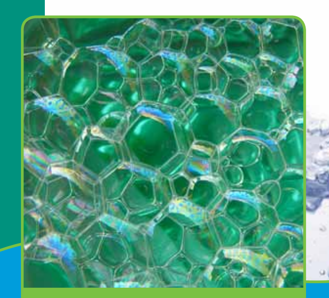
Ideal for both ponds and water gardens

Fast-acting product rapidly flattens foam Effective in isolated areas or whole water body People, pet and plant-friendly formula Safe for regular use