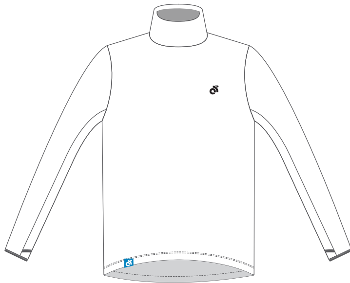
: Performance Winter/Winter Lite Mock Turtleneck : : MOS052 :