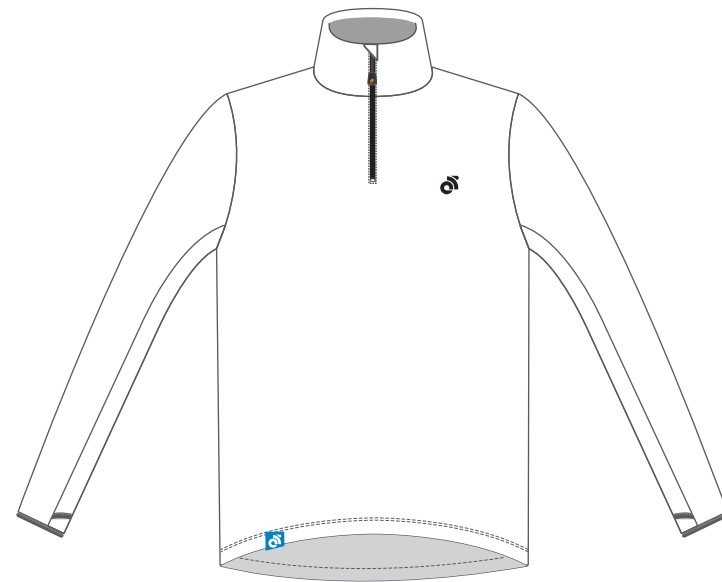
: Performance Winter/Winter Lite Zip Mock Turtleneck : : MTF020 :