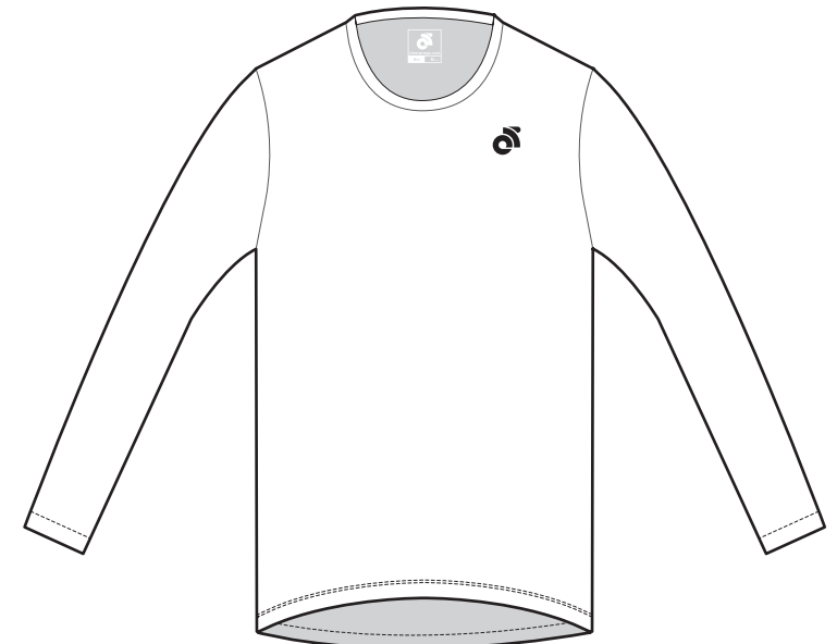
: Front View :