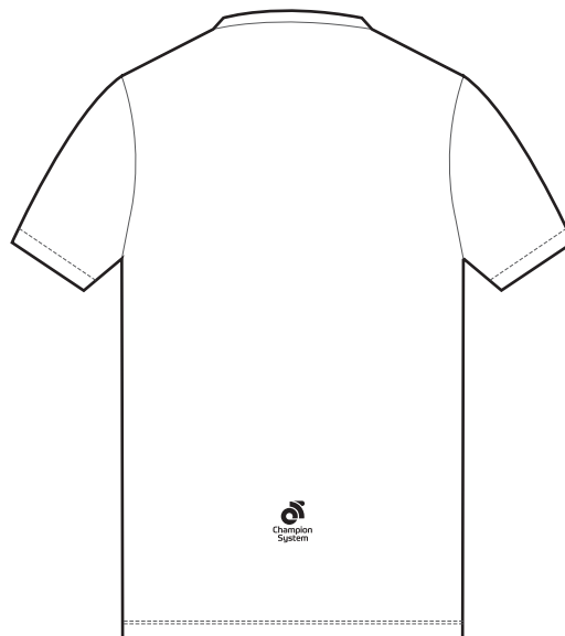
: Back View :