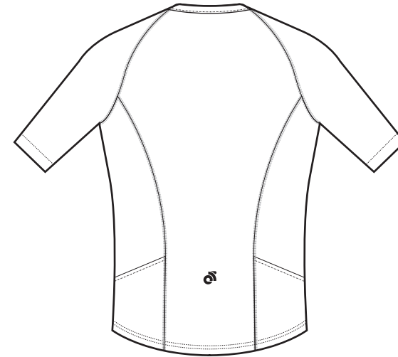
: Back View :