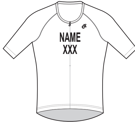
: Apex / Performance Tri Speed Top : [ MLJ100 / MLJ101 ]