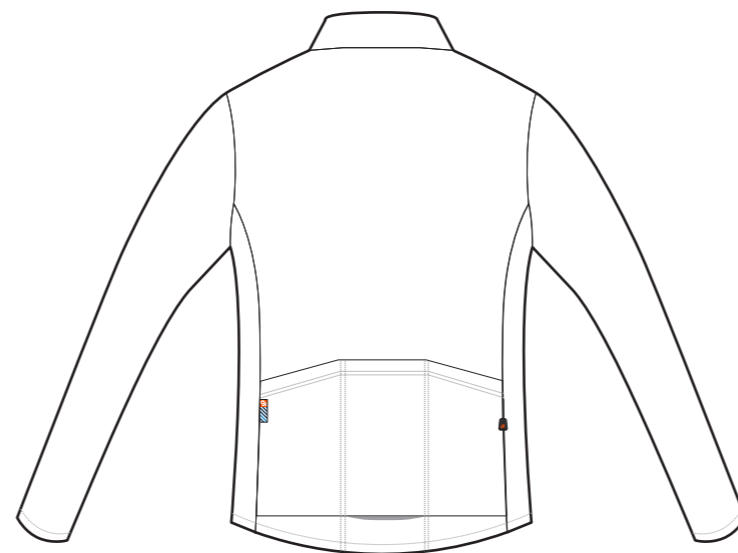
: PERFORMANCE Intermediate Jacket : (MTF123)