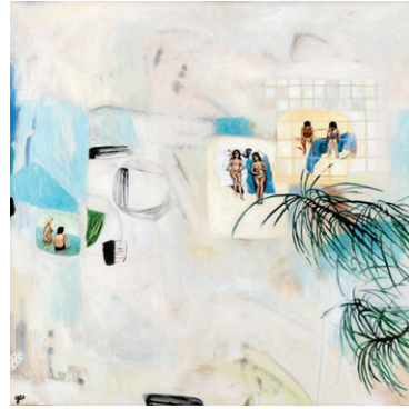
Georgie Wilson Above Average Moments Feel Fine. 2024 Synthetic Polymer on Canvas. Framed in Tasmanian Oak. 100 x 100mm $2950