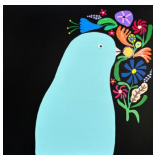
Madeleine Stamer Blue Peace Bird with Floating Meadow. 2024 Synthetic Polymer on linen. Framed in Tasmanian Oak. 435mm x 435mm $750