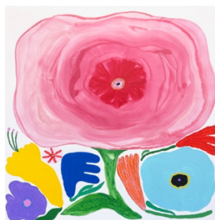
Madeleine Stamer Floating Meadow II. 2024 Synthetic Polymer on linen. Framed in Tasmanian Oak. 950 x 950mm $2850