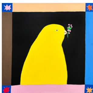
Madeleine Stamer Yellow Peace Bird with Blossom Sprig. 2024 Synthetic Polymer on linen. Framed in Tasmanian Oak. 435mm x 435mm $750