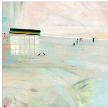
Georgie Wilson Light Sky Everywhere. 2024 Synthetic Polymer on Canvas. Framed in Tasmanian Oak. 100 x 100mm $2950