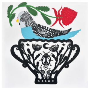
Madeleine Stamer Nesting Peace Bird Under a Floating Waratah. 2024 Synthetic Polymer on linen. Framed in Tasmanian Oak. 950 x 950mm $2850