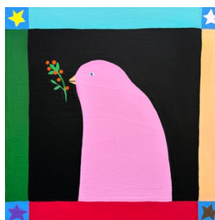
Madeleine Stamer Pink Peace Bird with Cumquat Sprig. 2024 Synthetic Polymer on linen. Framed in Tasmanian Oak. 435mm x 435mm $750