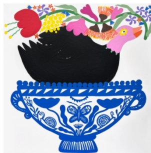
Madeleine Stamer Nesting Peace Bird Under a Floating Meadow. 2024 Synthetic Polymer on linen. Framed in Tasmanian Oak. 950 x 950mm $2850