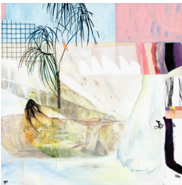
Georgie Wilson Ghost Bananas. 2024 Synthetic Polymer on Canvas. Framed in Tasmanian Oak. 100 x 100mm $2950