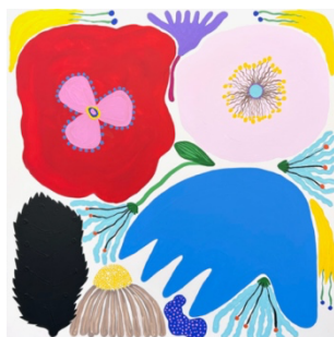
Madeleine Stamer Floating Meadow I. 2024 Synthetic Polymer on linen. Framed in Tasmanian Oak. 950 x 950mm $2850