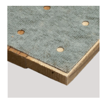
REVERSE OF TILE SHOWING PATENT PENDING BACKER