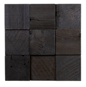
DIMENSIONAL SHOWN. ALSO AVAILABLE IN FLAT.