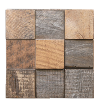
NATURAL (UNFINISHED) DIMENSIONAL SHOWN. ALSO AVAILABLE IN FLAT.