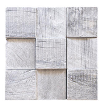
GLACIER DIMENSIONAL SHOWN. ALSO AVAILABLE IN FLAT