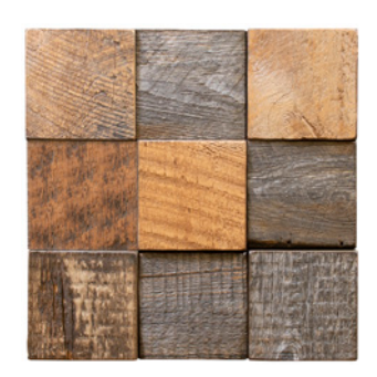
BUCKSKIN ALSO AVAILABLE IN FLAT