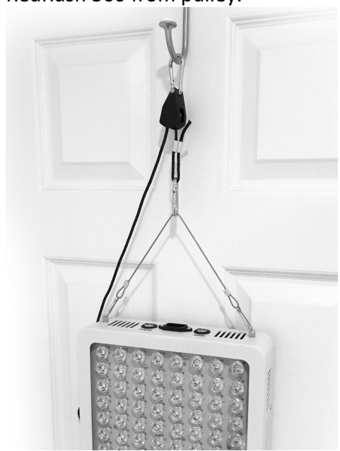
Adjust UP: Pull long cord while lifting up on light with the other hand. Adjust DOWN : Hold long cord firmly, lift metal release (on pulley). Lower to desired height. Pro Tip: CAREFUL. You'll be holding 10lbs on the cord.