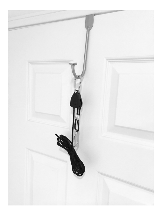
STEP 2: Clip adjustable pulley to the door hanging hook.