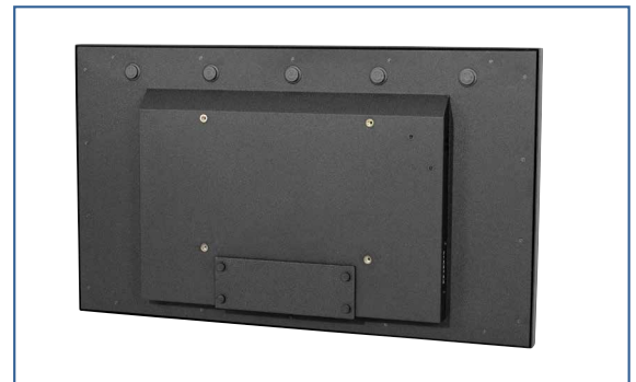
Sealed cable entry helps prevent water and debris from getting inside