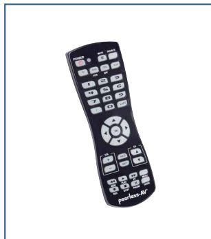
Waterproof Universal Remote