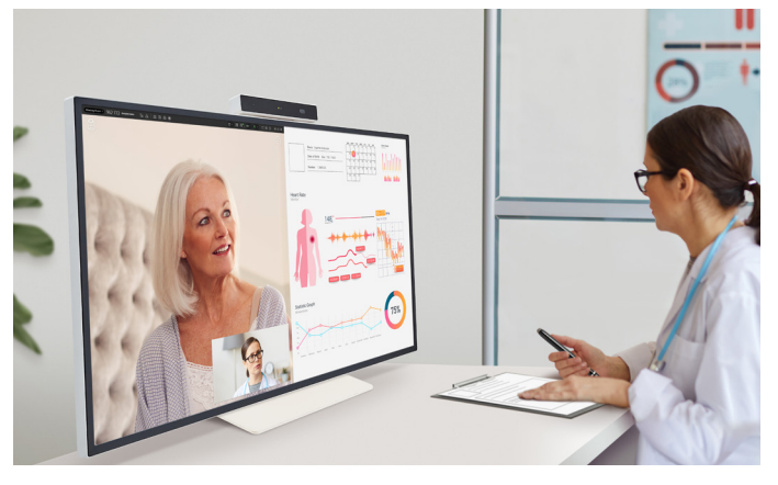
Perform simple consultations conveniently and remotely.