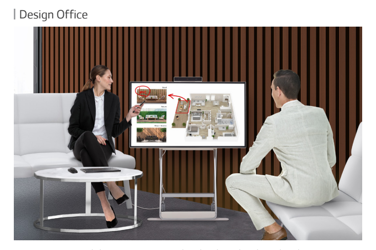
Presentations and demonstrations in the cloud can be shared with in-person and remote client participants.