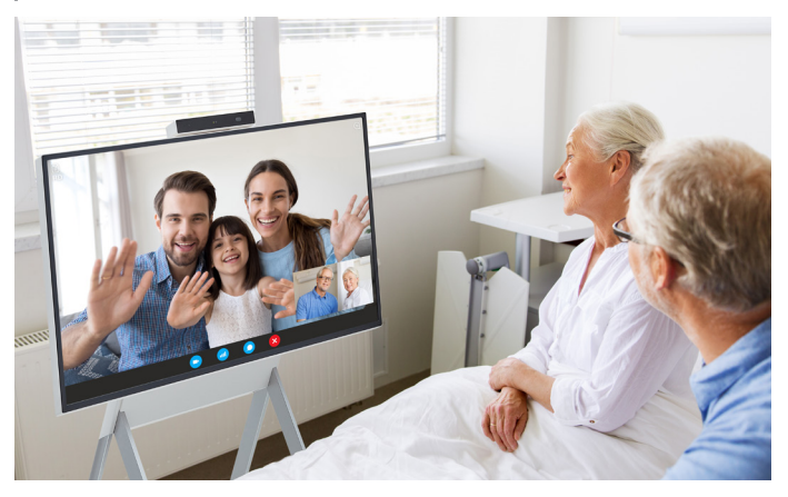
Re-connect with your family and relatives as if you were there.

* Screen configuration and function support may vary depending on the app used.