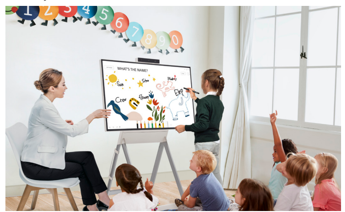
Increase interactivity with easily-saved and easily-erased drawings and activities that can be shared with remote learners.