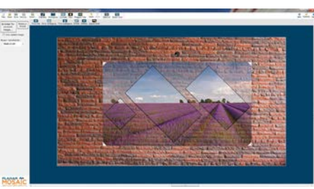
Planar Mosaic Project Designer software (Windows® edition)

Many video wall users want a single video scaled across the entire Planar Mosaic array, and occasionally have individual sources appear on individual Planar Mosaic tiles. This can be achieved multiple ways. For details and recommendations, download the Planar Mosaic Content Guide on www.planar.com/mosaic.