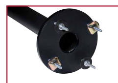
Slope nut security (shown without desktop surface)