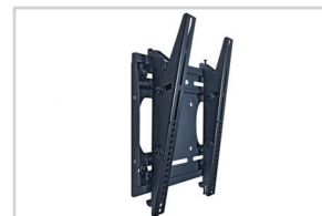
Displays sit less than 2 inches from their mounting surface