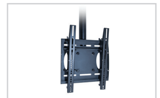
Mounts to walls, carts and stands, or suspended from the ceiling