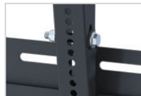
Made with corrosion-resistant materials and super durable powder coat for protection in outdoor environments