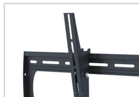
Holds displays less than 2" from the wall with 10° of downward tilt