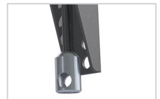
Lock-it™ Security barrel deters theft of display