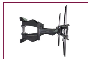
Expands flat panel displays up to 18 inches from the wall