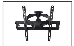
Designed to offer 12 degrees of downward tilt for today's slim line flat panels