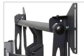
Patented Griplates™ hold the display tight on its mounting brackets