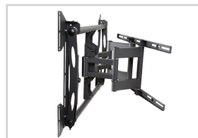
AM175 offers flat-panel displays 10° of tilt and 45° of swivel