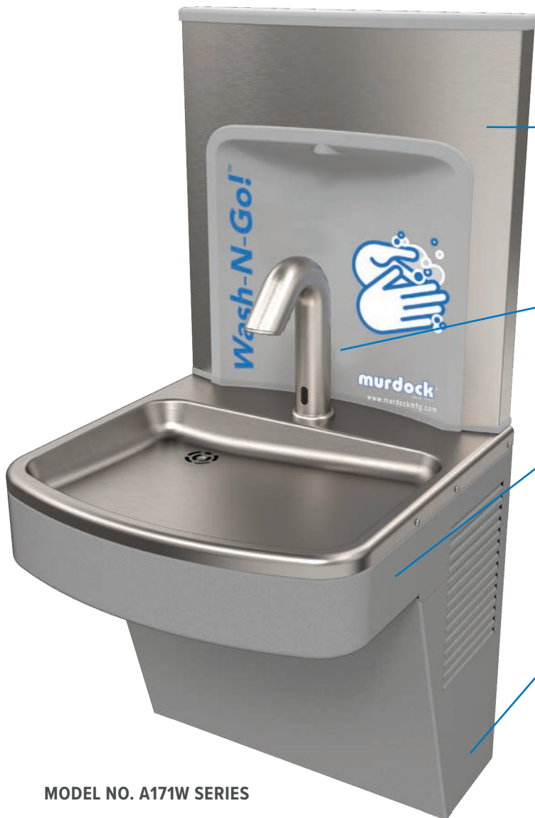
MODEL NO. A171W SERIES

CUSTOM COLORS/ LOGOS AND SATIN STAINLESS AVAILABLE