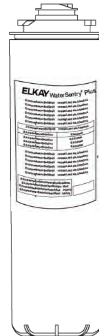
Replacement Model 51300C shown

This filter has been tested to the following NSF International standards: ANSI/NSF Standard 42 Chlorine-Class 1, Particulate-Class 1, and Taste and Odor. ANSI/NSF Standard 53 for Reduction of Lead.