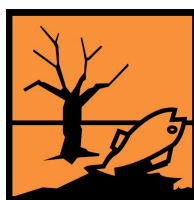
N: Dangerous for the Environment