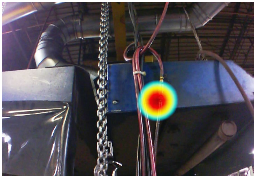
Images taken with the ii900 Sonic Industrial Imager in an industrial environment.

Fluke. Keeping your world up and running.®