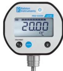
Field Gauge LC10-TA Digital Probe Thermometer