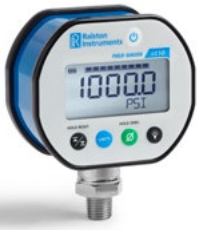
Field Gauge LC10