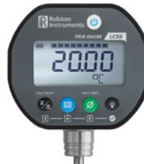
Field Gauge LC20-TA Digital Probe Thermometer