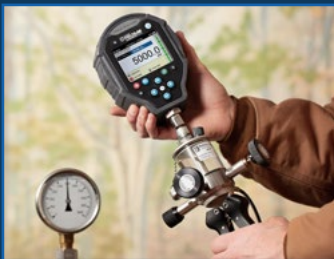
Gauges & Calibration References

Ralston Instruments provides complete pressure calibration solutions for a wide range of applications, saving time and taking the guesswork out of critical pressure testing, maintenance and repair operations.