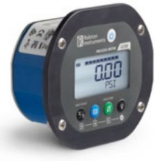
Panel Mounted Field Gauge LC30

Ralston Instruments provides complete pressure calibration solutions for a wide range of applications, saving time and taking the guesswork out of critical pressure testing, maintenance and repair operations.