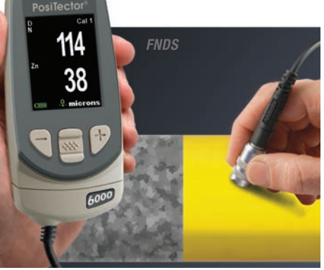
Duplex Probe measures individual layer thicknesses of zinc and paint in a duplex coating system