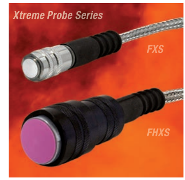
Xtreme Probes with Alumina wear faces and braided cables for hot/rough surfaces