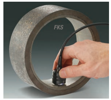
Thick Probes series for thick protective coatings: epoxy, rubber, fireproofing and more