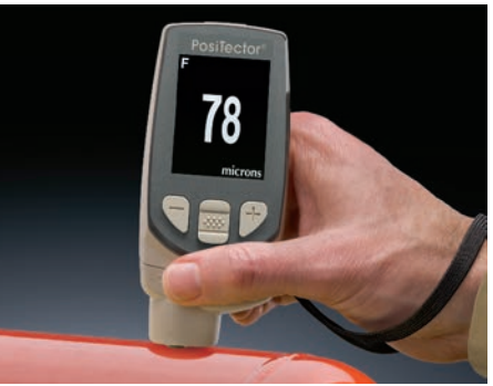
For measuring paint, powder, etc. on all metals...