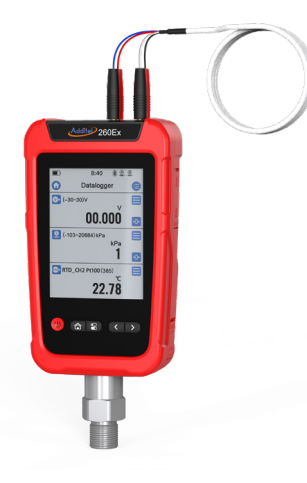
ADT260Ex with AM1602 temperature probe