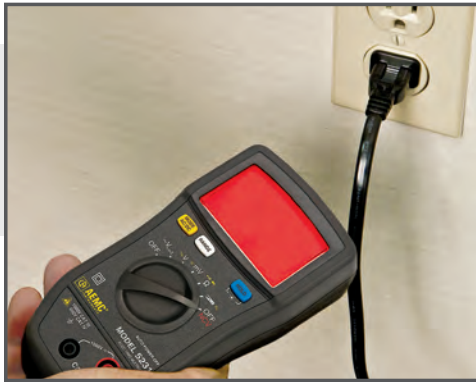
Non-contact detection of network voltage (NCV Function-AC only)