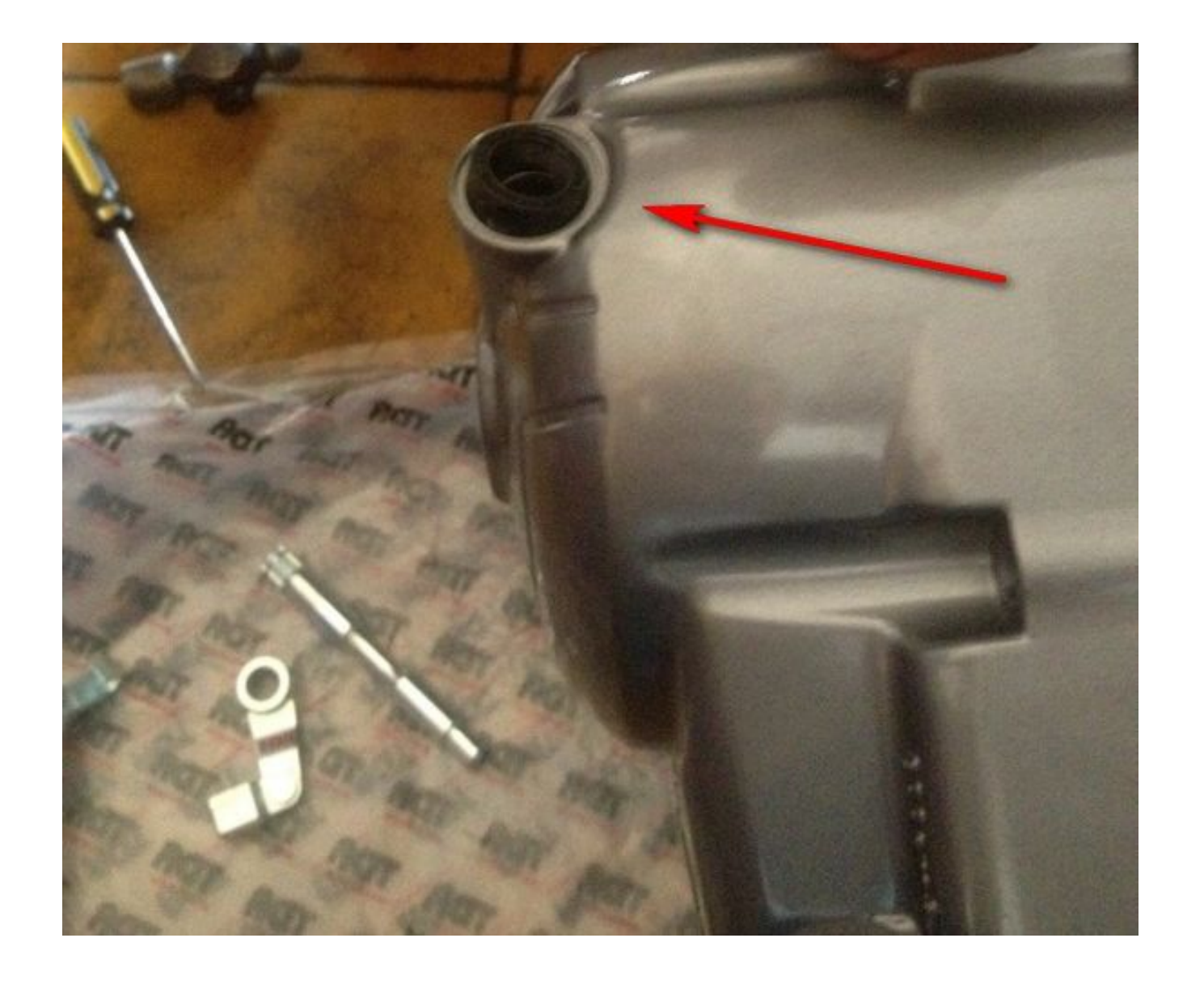
Then insert item no.4 and no.5 (rings)