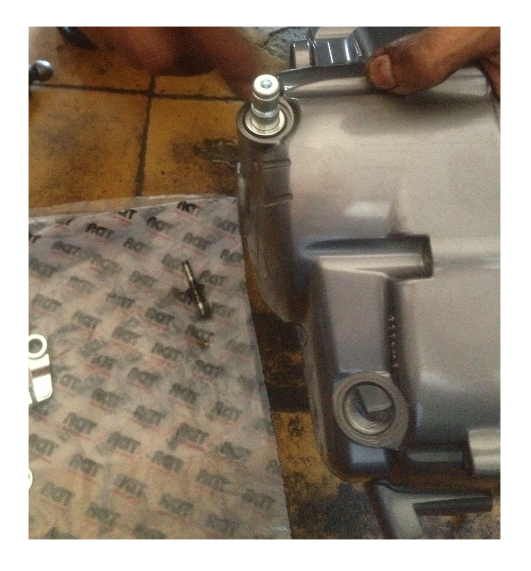
Then insert item no.9 and no.3 and then no.7