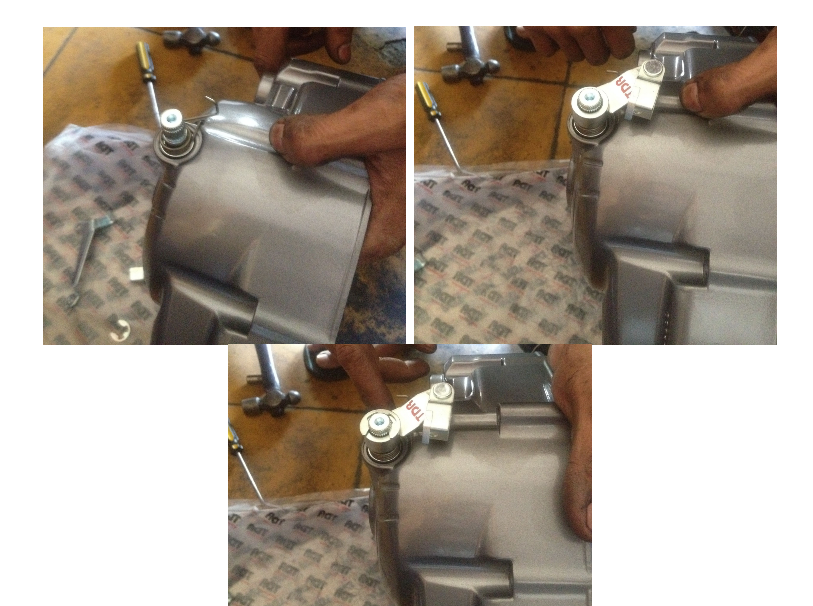
Put the new case to the bike