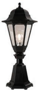
Coach Patio Lantern