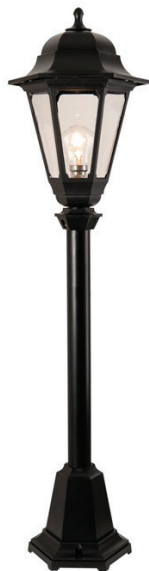
Coach Mini Column