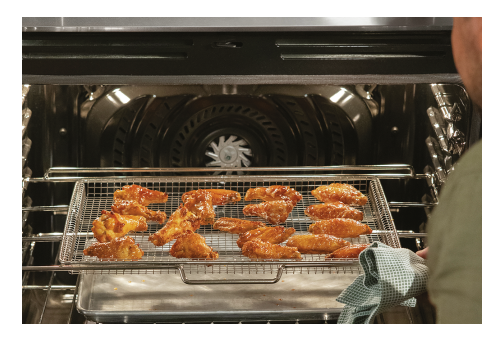
Take the guesswork out of cooking with the Temperature Probe

The Temperature Probe monitors and alerts when the desired finished cooking temperature has been reached.