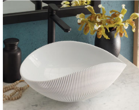
Shown in Bianco