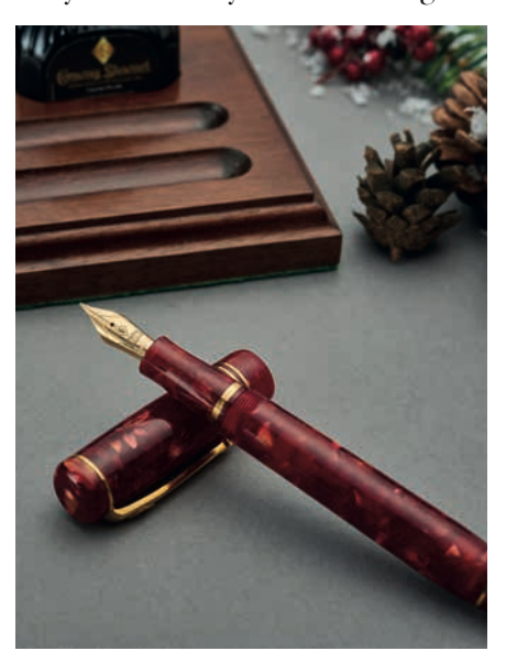
Fig 7 - Conway Stewart Winston Cherry red

All pens are made in the UK to the original technical drawings and using original Conway Stewart materials like Cherry Red, Classic Green and Classic Brown - the beautiful marbled acrylic resins that are iconic to Conway Stewart. All trims are made from precious metals including Sterling Silver and 9ct gold and hall-marked where width permits. (Fig. 7). They have recently launched a range