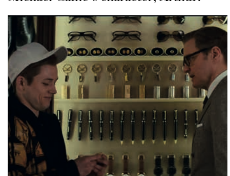
Fig 3 - Conway Stewart pens used in the Kingsman; The Secret Service

They also supplied the pens for various famous films including the Kingsman films The Secret Service (Fig. 3) and The Golden Circle. In the first Kingsman film, one of the pens, a Marlborough Vintage Ebonite Lever Fill, had a major role to play as it was used to kill Michael Caine's character, Arthur.