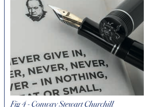
Heritage "Never Give In"

The Series 58 Indiana Jones Replica pen is a celebration of both quality