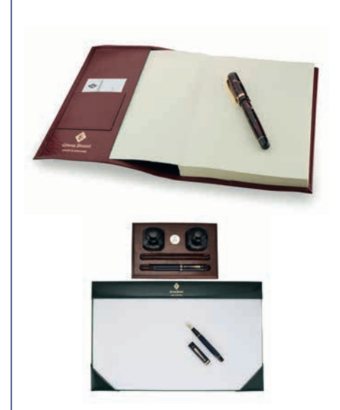
Fig 8 - New leather accessories – all made in England

of British made leather accessories including notebooks, pocket note pads, full and half demy sized traditional desk blotters, and pen cases. All of these are available in stunning premium Montana leather in green, burgundy, or black (Fig. 8).