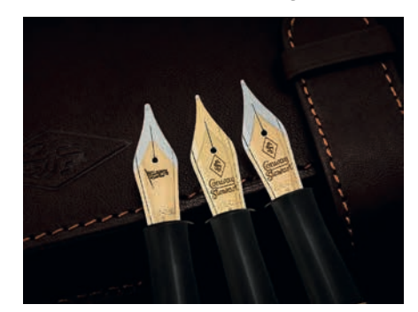
Fig 2 - Flag & CS 18ct Gold Nibs

Flag nibs, and they were engraved in Birmingham, England with the Flag logo. These new nibs were universally praised for being smooth and beautiful writers straight from the box, and many regarded them as being better than the old CS nibs (see Fig. 2).