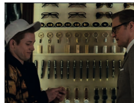
Fig 3 - Conway Stewart pens used in the Kingsman; The Secret Service

They also supplied the pens for various famous films including the Kingsman films The Secret Service (Fig. 3) and The Golden Circle . In the first Kingsman film, one of the pens, a Marlborough Vintage Ebonite Lever Fill, had a major role to play as it was used to kill Michael Caine’s character, Arthur.