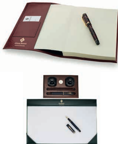
Fig 8 - New leather accessories – all made in England

of British made leather accessories including notebooks, pocket note pads, full and half demy sized traditional desk blotters, and pen cases. All of these are available in stunning premium Montana leather in green, burgundy, or black (Fig. 8).