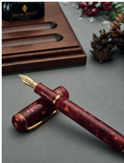
Fig 7 - Conway Stewart Winston Cherry red

All pens are made in the UK to the original technical drawings and using original Conway Stewart materials like Cherry Red, Classic Green and Classic Brown - the beautiful marbled acrylic resins that are iconic to Conway Stewart. All trims are made from precious metals including Sterling Silver and 9ct gold and hall-marked where width permits. (Fig. 7). They have recently launched a range