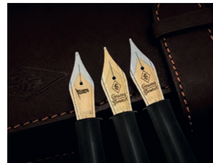
Fig 2 - Flag & CS 18ct Gold Nibs

Flag nibs, and they were engraved in Birmingham, England with the Flag logo. These new nibs were universally praised for being smooth and beautiful writers straight from the box, and many regarded them as being better than the old CS nibs (see Fig. 2).