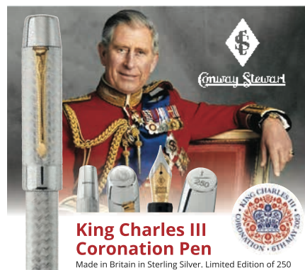
Fig 9 - King Charles III Coronation Pen

THEY HAVE RECENTLY LAUNCHED A RANGE OF BRITISH MADE LEATHER ACCESSORIES