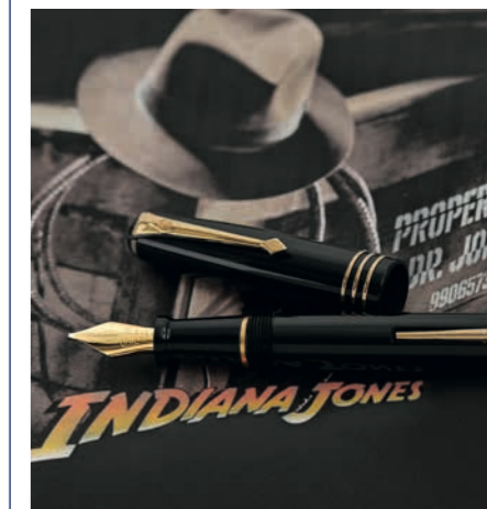
Fig 5 - Indiana Jones Replica pen

The scene finishes with Marcus Brody’s humorous comment “Henry, The Pen. Don’t you see? The pen is mightier than the sword!” These were a limited edition of only 100 pens produced worldwide and sold out very quickly. (Fig. 5)