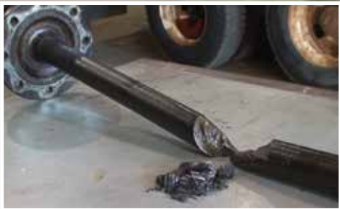
Broken axle with metal chips extracted from axle housing by the ReverseForce Air Gun .