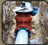
Water and Sewer Lines