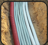
Electric Power Lines