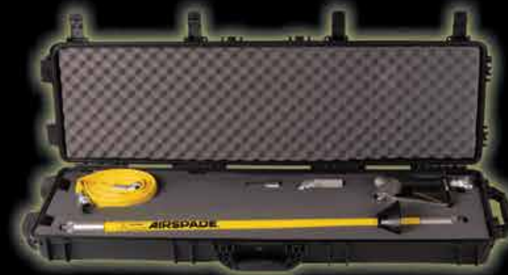
AirSpade 2000 Arbor/Landscape Kit shown above.

Air exiting from an improperly designed nozzle diffuses outward rapidly to 3 to 4 times the area versus the focused air-jet from the patented AirSpade supersonic nozzle. With AirSpade, the result is faster, safer, more efficient soil excavation.