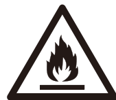
Warning; Risk of fire / flammable materials