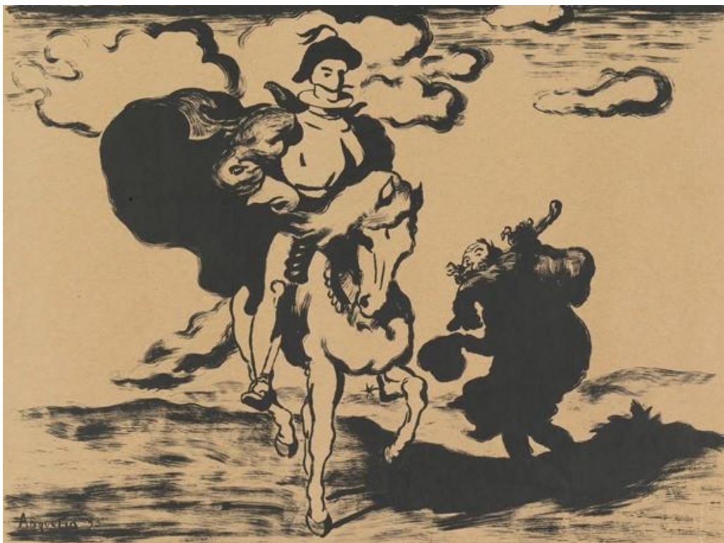
Louis ANQUETIN (Etrepagny, January 26, 1861 – Paris, August 19, 1932) Le Cavalier et le Mendiant The Rider and the Beggar (English title) Lithograph printed in black on tan wove paper, 1893. References: Stein & Karshan 1; Boyer & Cate 1. Plate number 1 from L'Estampe Originale . Signed and numbered in red crayon (red pencil). Image size: 14 ½ x 19 ¼ inches.