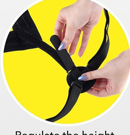
Regulate the height using the velcro with logo