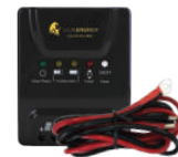
SAVANNA CC™ Solar Charge Controller