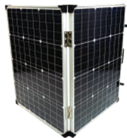
LION 100™ 100W Folding Solar Panel