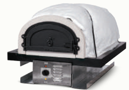
CBO-750 Hybrid Bundle

The 750 model features a larger cooking surface. The hearth now comes in three pieces for easier installation. For quick-heating convenience, we offer a 750 Hybrid model with a two-burner gas system. It can also be used as a wood-burning oven.