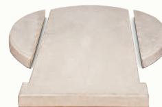
CBO-750 Hearth Insert