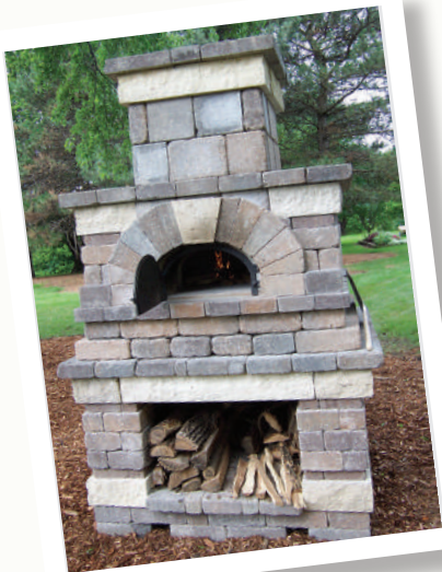
CBO-750 Bundle with Custom Enclosure

Our 500 model is a great choice for layouts that require a compact footprint. It delivers an authentic wood-fired cooking experience in a simple, value-driven package.