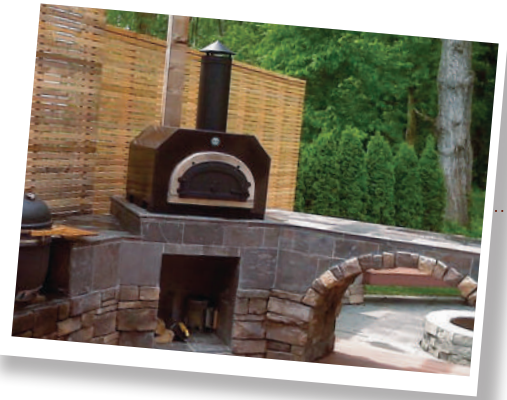
CBO-500 Traditional Countertop in Copper Vein