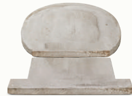
CBO-500 Hearth Insert

Our 500 model is a great choice for layouts that require a compact footprint. It delivers an authentic wood-fired cooking experience in a simple, value-driven package.