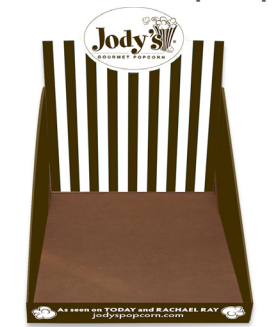
Looking for to display your product, but want flavors not included in the Classic collections? Here's just what you're looking for! Order 4 cases of popcorn and receive an empty display at no cost! CD-EMPTY