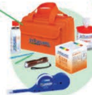
Fiber Optic Cleaning