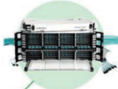
Pretium EDGE® HD Solutions