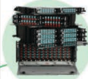
Closet Connector Housing (CCH)