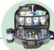
The UniCam® High-Performance Tool Kit (TKT-UNICAM-PFC)