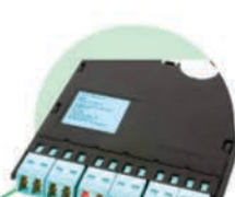
Pretium EDGE® Modules