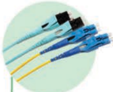
Pretium EDGE® Reverse Polarity Uniboot Duplex Jumper