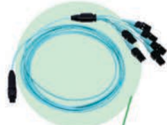
Pretium EDGE® MTP® Trunks