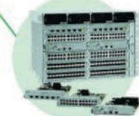
Allied Telesis SwitchBlade® x8112/ x8106