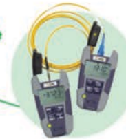
JDSU OMK 35 - Handhelds Pocket Class Meter Series