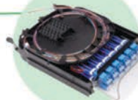
CCH Pigtailed Splice Cassette