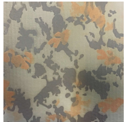
Natural Gear Camo Sample

For other instructions and more products visit our website at backwaterperformance.com