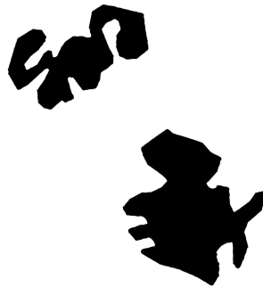
Highlight Pattern Sample