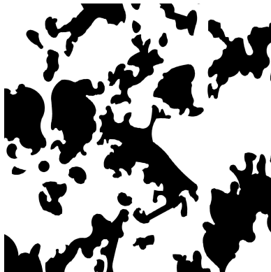
Main Pattern Sample