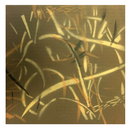
Main Pattern Sample