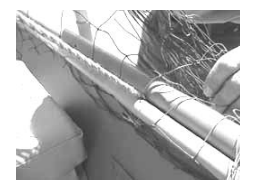
This is what the rope will look like once the PVC has been laid on the gunnel.