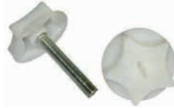
4x Bed Bolts