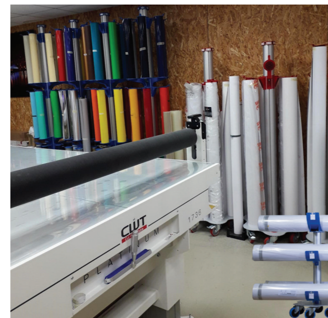
Company Com1Pub, Dieppe (76).

■ For further information contact@stock-and-roll.fr www.stock-and-roll.fr