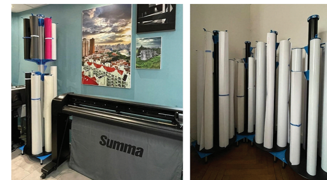
Company Tirage à Part, Metz (57).

The company's product range has grown over the years, mainly in response to customer demand. The Stock & Roll models can store and transport up to 6 rolls 160 cm wide in a vertical position, while the Grand Stock & Roll is suitable for moving up to 18 rolls and can carry up to 900 kg. For larger widths up to 5 m, Buddy Rolls will do the trick. This trolley can carry up to