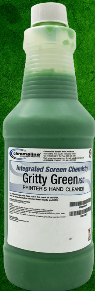
QUART - SKU: CMSD-GRITTY-Q

Step up your cleanup game with the Chromaline Gritty Green Hand Cleaner. Crafted for the screen printer who knows the struggle of stubborn ink stains, this water-based warrior doesn't mess around. It's your frontline defense against ink invasion, ensuring that your hands emerge victorious - clean, moisturized, and ready for the next print run.